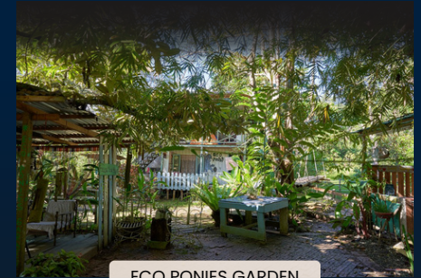
ECO PONIES GARDEN